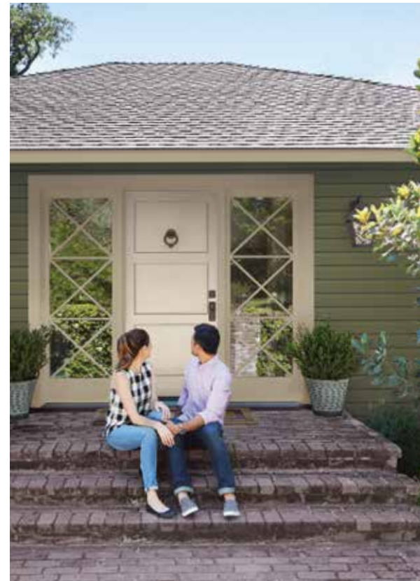
Elm Grove™ D4DL in Cypress, Exterior Portfolio® Vinyl Trim in Rye

PVC resin is the backbone of our vinyl siding, and begins with two abundant building blocks: chlorine from common salt and ethylene from natural gas. The PVC resin is optimized with a range of other proprietary ingredients to provide a reliable exterior product that can be formed into a range of shapes, and last a lifetime.